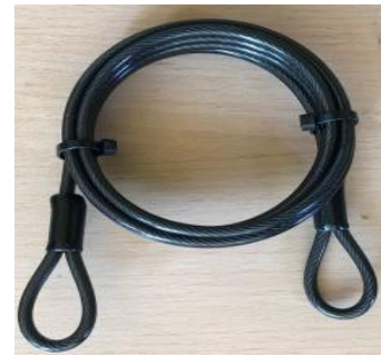
Cable dia 4.8* 2,000mm (galvanized twisted steel with PVC coating)